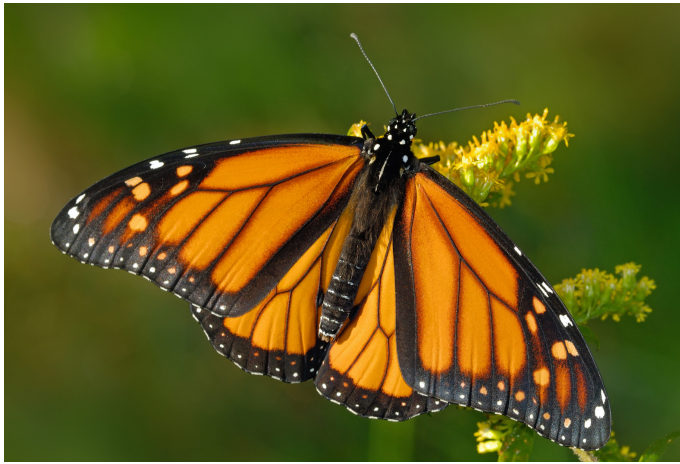
Monarch, in Connecticut (male;)

should be changed in such practices that would be more favorable to native biodiversity—evidence that GMOs and concomitant agricultural practices are the primary factors in Monarch decline is circumstantial and in need of study and corroboration. The population declines since 2011 have been so dramatic, and have occurred over such broad geographical areas, that many would argue that the region-wide droughts in northern Mexico and Texas, and not the sum of gradual changes in agricultural practices in the Midwest, are at the root of this collapse.